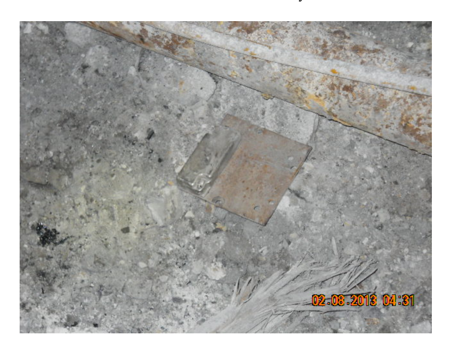
Safety Switch Actuator on the Ground During Accident Investigation