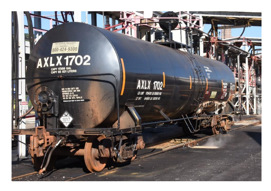
Figure 1. Tank car AXLX 1702 after chlorine release.